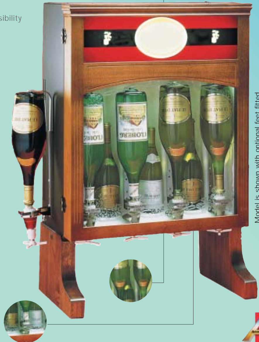
Model is shown with optional feet fitted